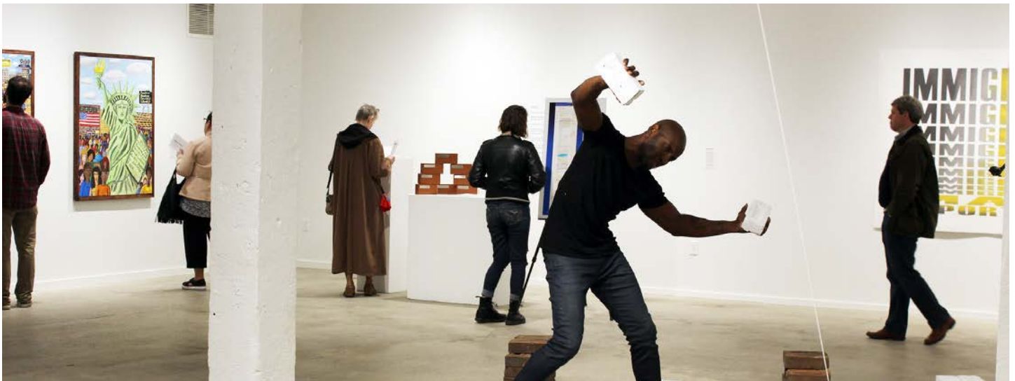
The First 100+ Days