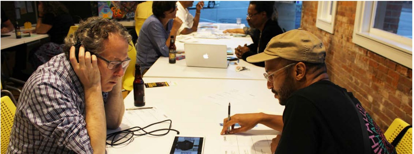
8x8x8, image courtesy of SPACES