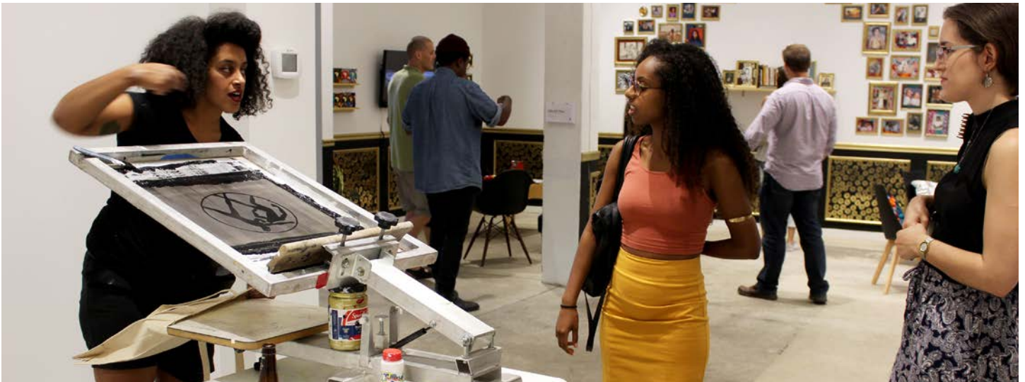
UR:AD Press, UR:AD TV , image courtesy of SPACES