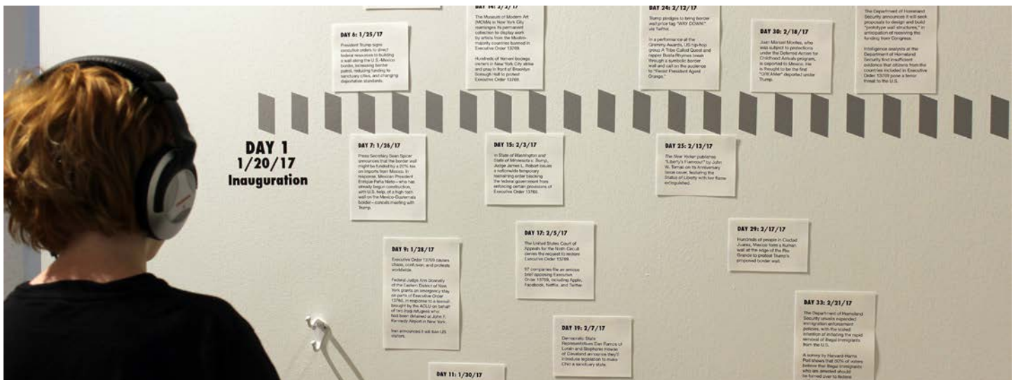
Kid Art Review