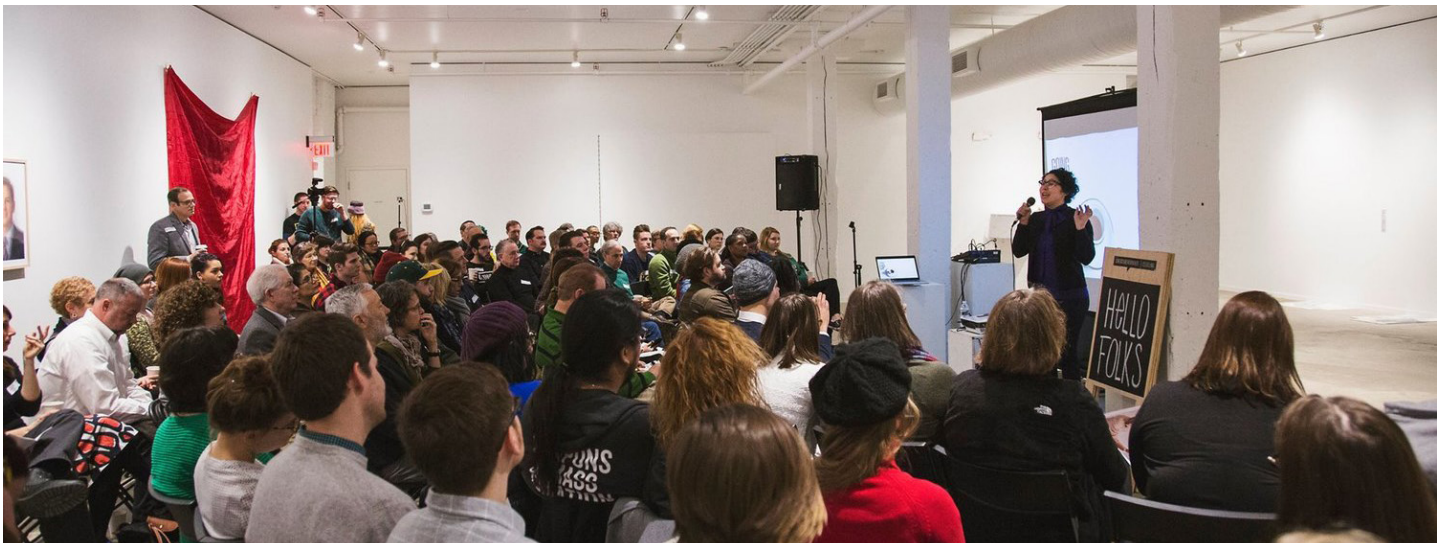
Creative Mornings at SPACES

We distill complex ideas into transformative experiences by meeting people where they are to conduct art-making activities. Create it Forward: Realizing the Potential in Our Incarcerated Youth connects professional artists with students in the Cuyahoga County Juvenile Detention Center to make artwork that benefits constituents of local nonprofits; Make Your Own teaches young residents of Lakeview Terrace public housing how to make art supplies with household items; and Write, Rinse, Repeat is a mural program for teen peer groups to write and install inspirational quotes in areas with high teen drug overdose rates.