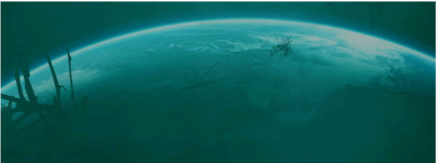
Snow Yunxue Fu, Side