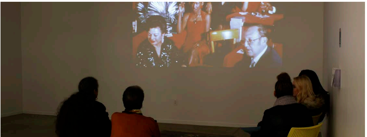
Soda_Jerk, Astro Black