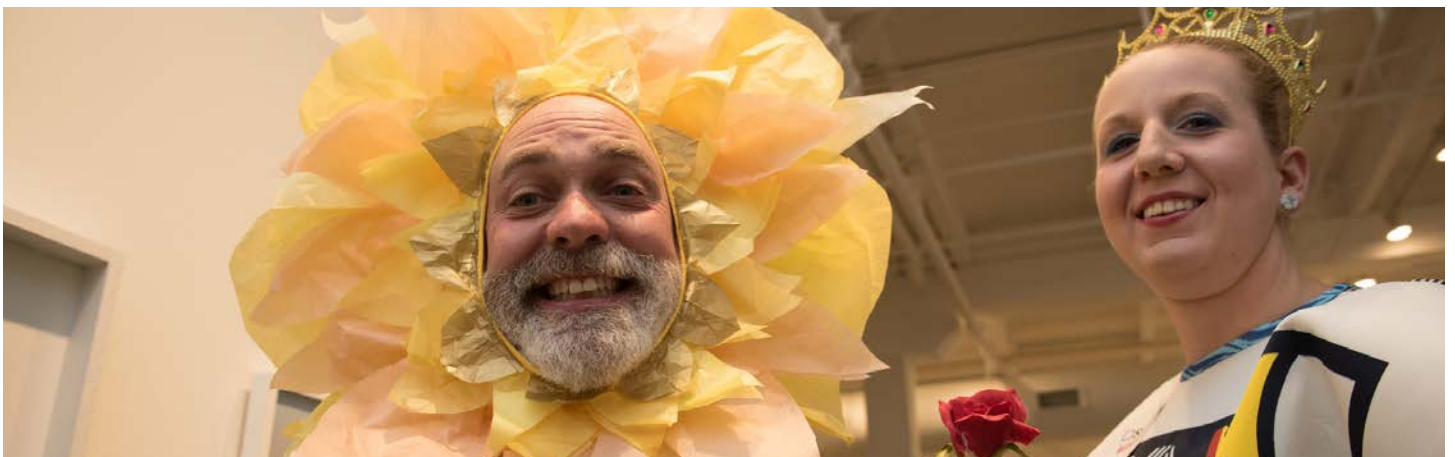
SPACES In Wonderland, SPACES Annual Benefit

SUPPORTERS Blick Art Materials | Dave's Markets | FORM | Great Lakes Brewing Company | Insomnia Cookies | L'Nique Specialty Linen Rentals | Luna Baker & Cafe | MANCAN | Jerry Mann Photography | Marigold Catering | Mason's Creamery | Steve Mastroianni Fine Art Photography | Mitchell's Ice Cream | OYO / Midwest Spirits | Red Bull | Riot Creative Imaging | Rock the House | Sainato's at Rivergate | Vedda Printing+ | WONGFACE