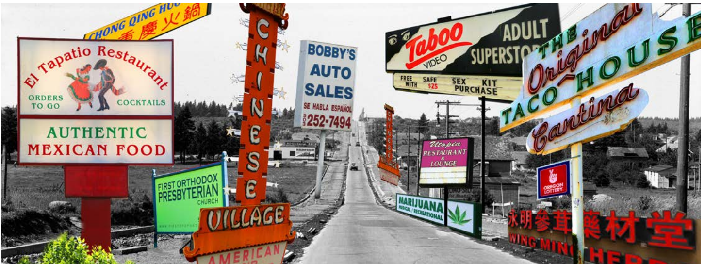
Sabina Haque, Signs of the Times