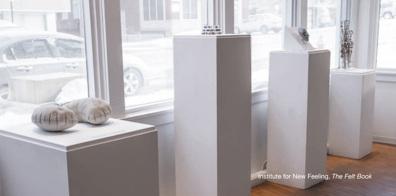
Institute for New Feeling, The Felt Book

If artists are to honestly respond to their age and be a cultural interpretive lens, they must be free to explore and experiment with little or no constraint. SPACES affords artists an opportunity to reach their full potential without the imposition of the market place.